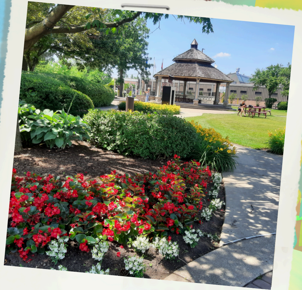
CLOCK TOWER PARK